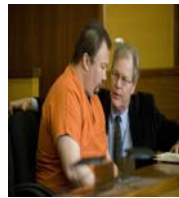
UP TO $2,000 FEES TO DEFEND & $1,000 TO PROTECT YOU