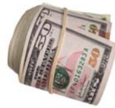
MATRIX REWARD INCOME!!!