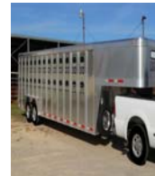
LIVESTOCK TRAILER EMERGENCY ROADSIDE ASSISTANCE