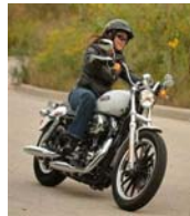
MOTORCYCLE EMERGENCY ROADSIDE ASSISTANCE