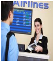
TRIP PLANNING & TRAVEL DISCOUNTS