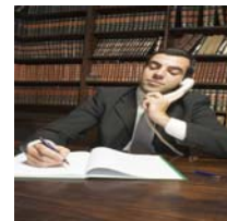
LEGAL SERVICES PHONE CONSULT & LETTERS WRITTEN ON PERSONAL MATTERS