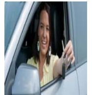
UP TO $500 TRAVEL ASSISTANCE REIMBURSEMENT