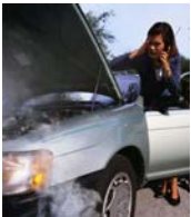
VEHICLE EMERGENCY ROADSIDE ASSISTANCE