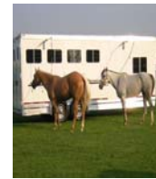
$500 FARM EQUIPMENT REWARD