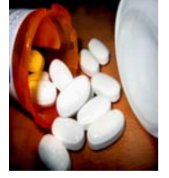
FREE VISION, PRESCRIPTION & DENTAL DISCOUNT CARD