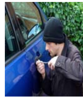
A $5,000 STOLEN VEHICLE REWARD