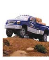
DUALLY OVER 1 TON EMERGENCY ROADSIDE ASSISTANCE