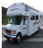
RV EMERGENCY ROADSIDE ASSISTANCE