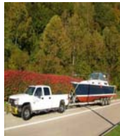
BOAT TRAILER EMERGENCY ROADSIDE ASSISTANCE