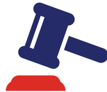
Up to $2,000 Legal Fee