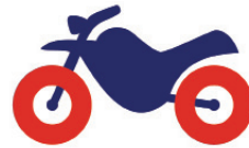
Motorcycle Emergency Roadside Assistance