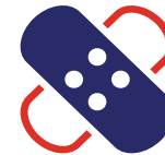
Travel Assistance Program

All accidents: at work, at home or at play.