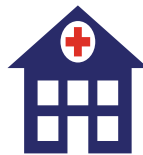
Up to $54,750 Daily Hospital Benefits