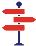
Trip Planning & Travel Discounts