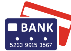
$1,000 Credit Card Protection