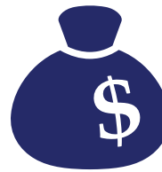
$5,000 Stolen Vehicle Reward