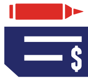
Up to $25,000 Bail Bond